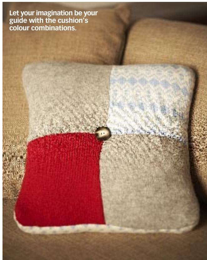
Let your imagination be your guide with the cushion's colour combinations.