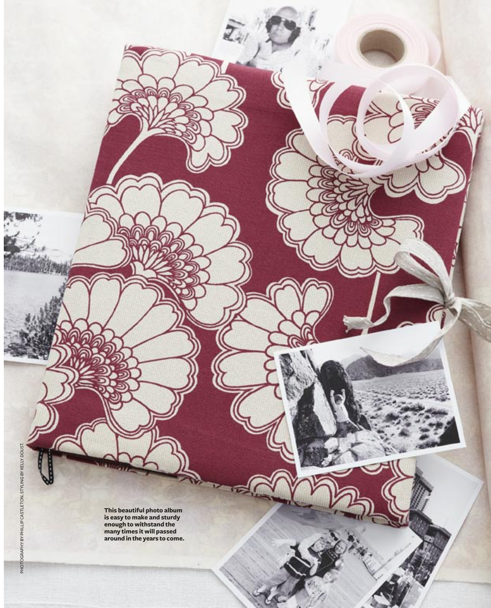
STYLING BY KELLY DOUST.

This beautiful photo album is easy to make and sturdy enough to withstand the many times it will be passed around in the years to come.